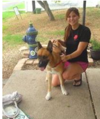
Charlie, adopted '09