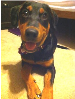
Bear, adopted '11