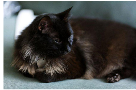
Fusion, adopted August 2001

Send us your "Happy Tail" to bascontact@brazosanimalshelter.org