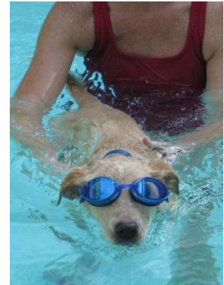
Shipley, adopted '11

Truth is...I may have rescued her, but she saved me ♥ Ashley about Flower (adopted 2010)